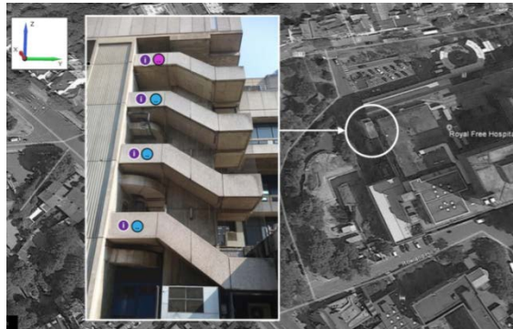
North-West External Concrete Stair