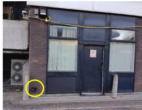
MRI Scanner Room 4