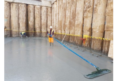
Casting of basement slab

If you become aware of an urgent operational issue concerning the construction, please contact Willmott Dixon immediately on its out-of-hours number: 08457 335533. For any other enquiries concerning the project, please contact rf.pearsinfo@nhs.net .