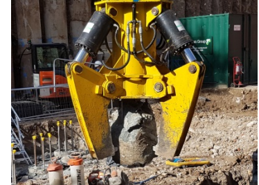
Cropping of piles

If you become aware of an urgent operational issue concerning the construction, please contact Willmott Dixon immediately on 07704 260779 (weekdays) or 08457 335533 out of hours. For any other enquiries concerning the project, please contact rf.pearsinfo@nhs.net .