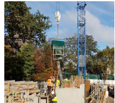
Works to external retaining walls